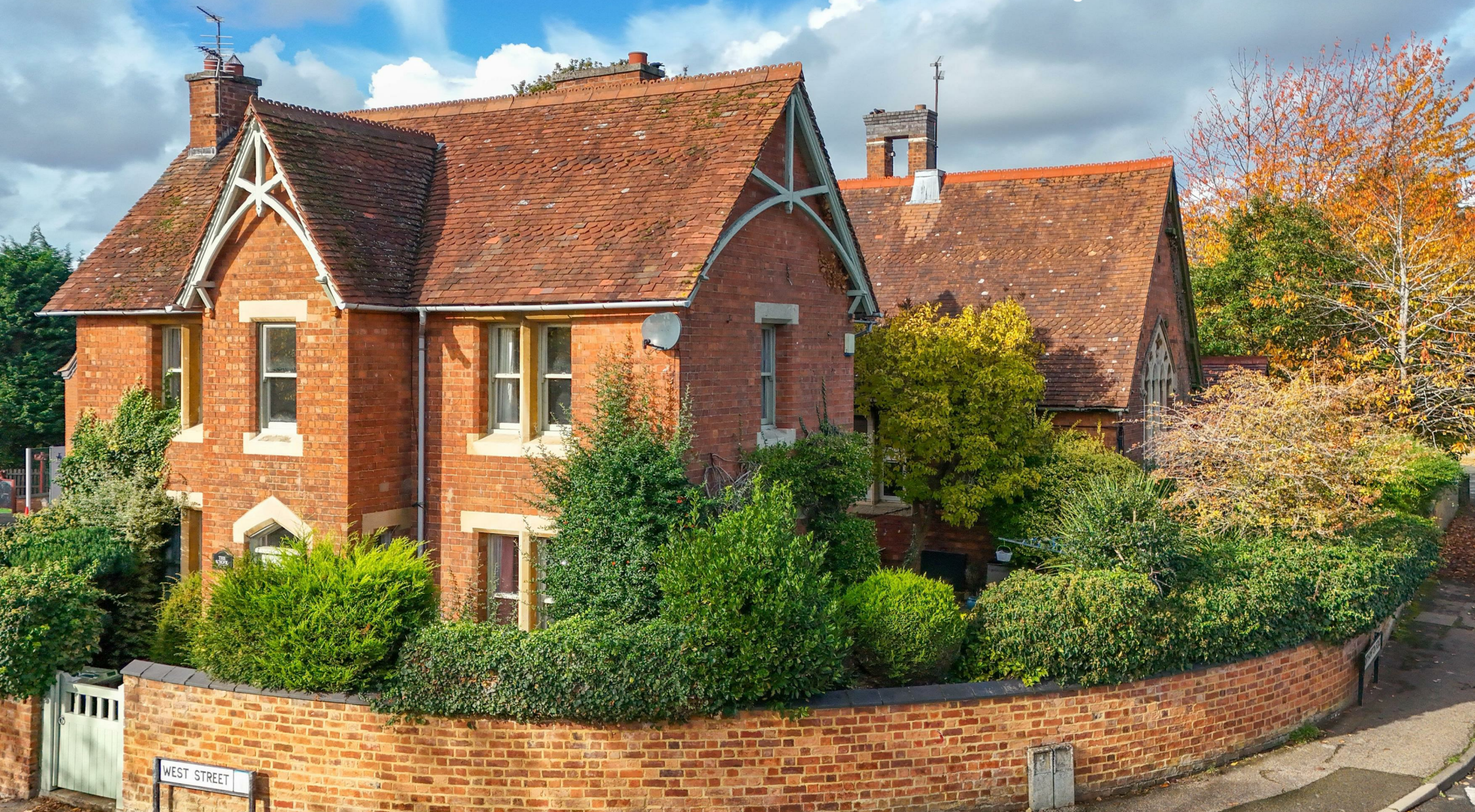
The School House 2 West Street, Ecton, NN6 0QF